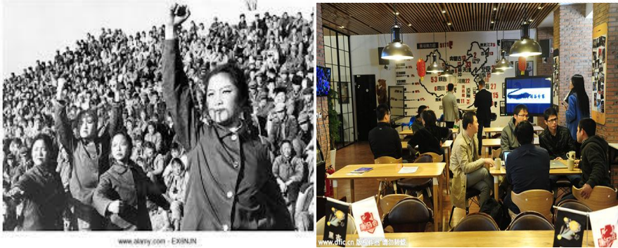
Figure 1. Journey from Ideology to Entrepreneurship: From raising Slogans to launching Start-ups

But the SEZs and China's Policy of Reforms took 12 years and a 'Mega disaster' to be crowned with success. Nobody knew that the Tian Anmen Incident of June 1989 would prove to be a 'blessing in disguise'. While most of the China Watchers in the Western world were voicing the opinion that China would surely give up its Open door Policy and reverse the Reforms, the opposite indeed happened!